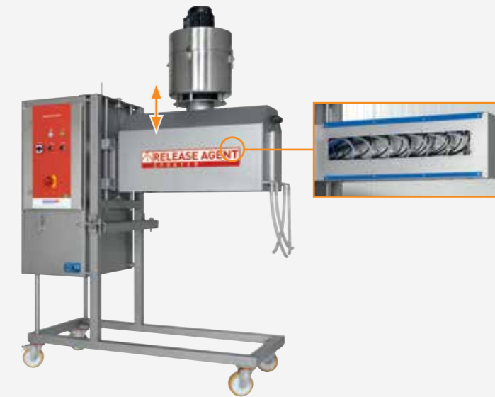
Movable RELEASE AGENT SPRAYER on C-frame

The movable stainless steel frame is the base of the machine on which the units (spray hood, exhaust) are mounted. The main cabinet holds the pneumatics and the liquid holding tank.