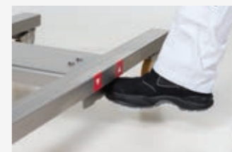
E Foot pedal