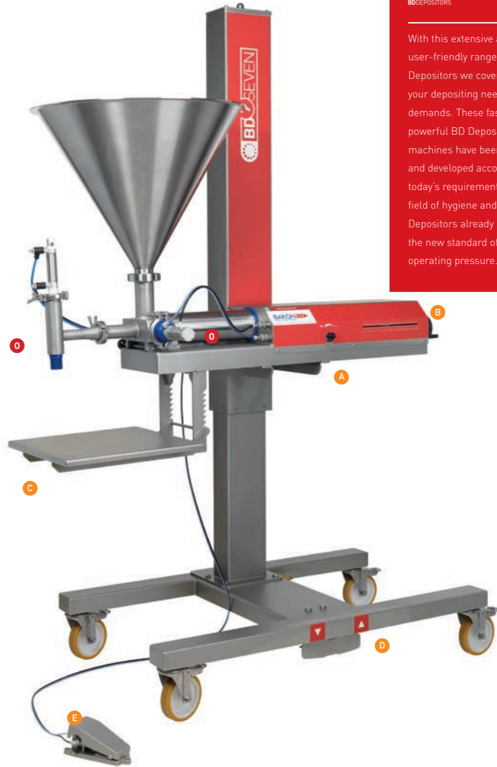
A Dosing volume The dosing volume is manually set and indicated on the scale