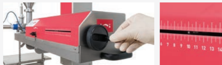
B Dosing speed The dosing speed can easily be adjusted by means of a rotary knob