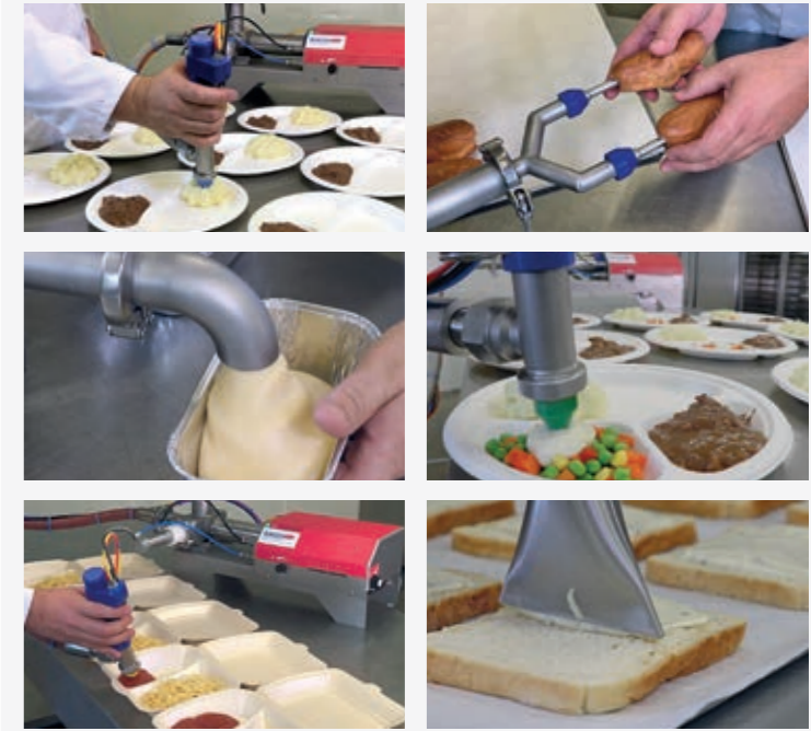
X Model with hose and gun

With this extensive and user-friendly range of BD Depositors we cover all your depositing needs and demands. These fast and powerful BD Depositing machines have been designed and developed according to today's requirements in the field of hygiene and all BD Depositors already meet the new standard of 4 bar operating pressure.